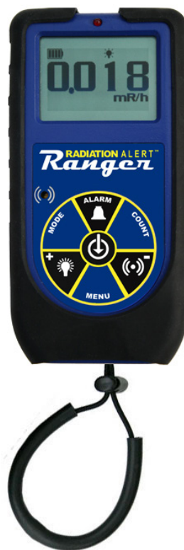
Shown with ruggedized protective boot