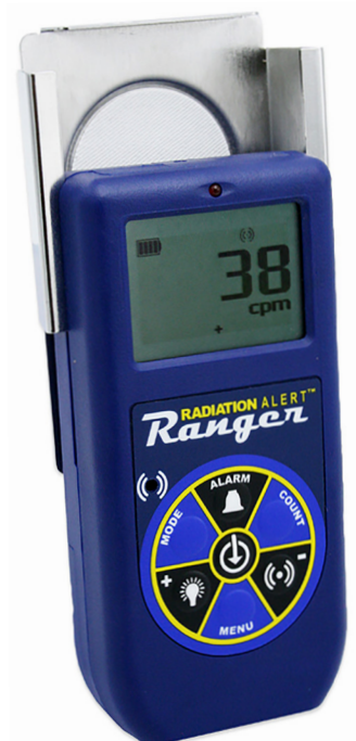
Optional Wipe Test Plate Shown