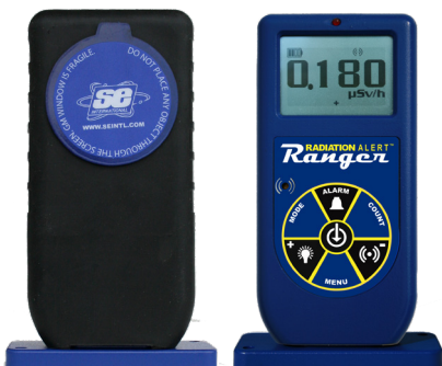
Lanyard, Ruggedized Boot, Detector Cover, USB Cable and Stand Included